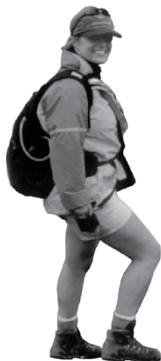
Be ready for any conditions.

Visit the Department of Conservation website: www.doc.govt.nz